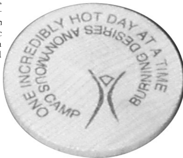
Chip given at Anonymous Camp

For information about Anonymous Camp, if you'd like to do service, or for meeting schedules, send email to anonymouscamp@p90.net