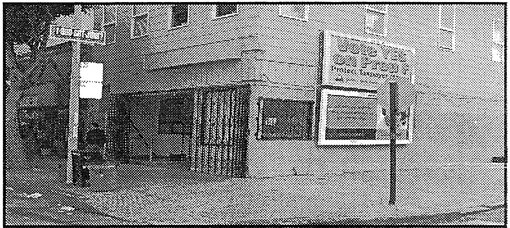
The Home of the Mission Fellowship on the Northwest Corner of 24th & Florida Streets

Two years ago 1010 Valencia Street transplanted its fellowship to 2900 24 th Street. Its membership contributed time, energy and money to refurbish, paint and clean these modest digs into a meeting place for all to enjoy. Within a year, more than 100 participants celebrated the first anniversary, listening to the tales of three old Timer's recounting the highlights of finding sobriety at this fellowships prior locations at 1364 Valencia, then 1010 Valencia, and now 2900 24 th Street. Within two years all of its relocation expenses had been paid. On Friday, March 22 of this year that same fellowship celebrated its second anniversary and this time with its new name "Mission Fellowship".