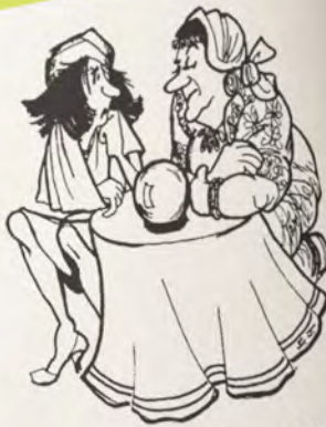
"Who cares about the future — where the hell was I last night?" — A Rabbit Walks Into a Bar