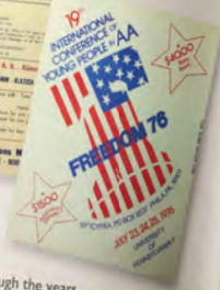
ICYPAA posters through the years.