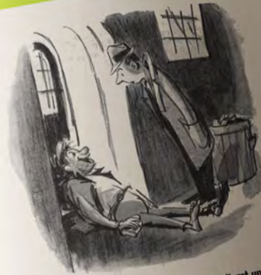
"I'm not powerless over alcohol. I just can't get up." — A Rabbit Walks Into a Bar